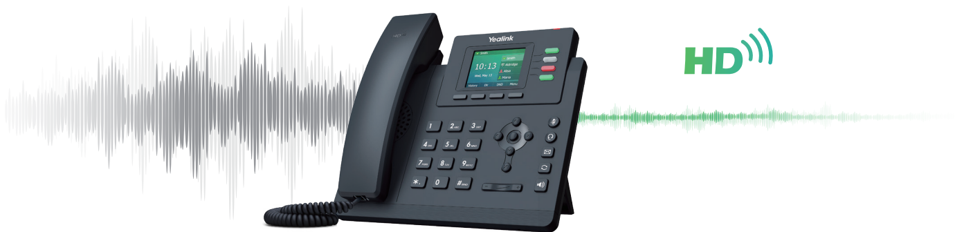
Smart Noise Filtering

The Yealink T3 series provides distraction-free communications with industry leading Smart Noise Filtering Technology, which delivers excellent sound quality without extraneous noises and allows fluent conversations.